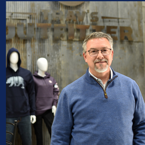
RETAILER OF THE YEAR TRAV'S OUTFITTER WATERTOWN