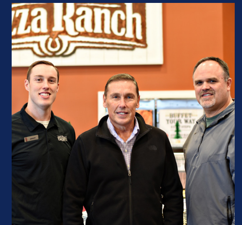
COMMUNITY SERVICE AWARD PIZZA RANCH, 41ST ST SIOUX FALLS

Each year, SDRA presents the Retailer of the Year Award to recognize a business or business owner who is committed to excellence while making a difference in their community.