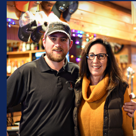
RESTAURANT OF THE YEAR CATTLEMAN'S CLUB PIERRE